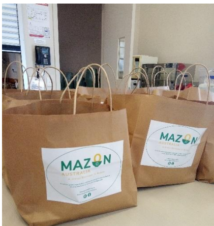
Soup in a Bag from Mazon

SJOS was privileged to be supported by Mazon Australia with their annual Soup Bag Campaign. They provided SJOS with 100 bags of fresh and non-perishable items with a soup recipe. Each bag contained sweet potatoes, zucchinis, onions and potatoes, plus seasonings and a recipe card. Thank you Mazon Australia for your support and giving the visitors to the SJOS Food Store such a healthy food option.