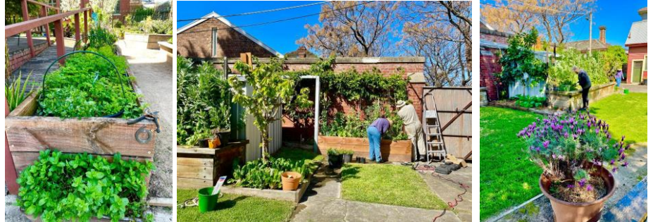
The SJOS Garden Team working in the garden and around the new garden bed

The new garden bed is now well into its growing mode and the Garden Team are working industriously on the new season's crop. The volunteer harvesting team are picking and bagging the harvest every week, allowing the families attending the Food Store to continue to enjoy fresh produce. SJOS would like to thank the Garden Club members for all their hard work and enthusiastic endeavours.