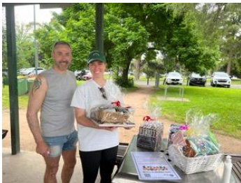
Friend-A-Thon Raffle Prize Winner