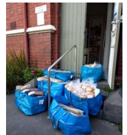
Bunnings Food Drive