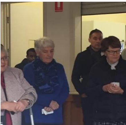
Volunteers at the SJOS Morning Tea.