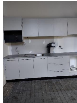
SJOS Unit 4 Kitchen