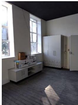
SJOS Unit 4 Living Room

The refurbishment of Unit 4 in the SJOS Housing Units finally commenced at the end of May. The unit was completely gutted, to be made ready for the new kitchen, bathroom, and storage units, as well as all new fittings and fixtures. The families staying at the SJOS Units now stay longer, due mainly to the lack of low-cost housing availability, and they have more possessions, so they need more storage facilities. The new refurbished units will have larger wardrobe space, more cupboard facilities in the living area and kitchen, plus storage for cleaning materials. We hope that Unit 4 will be completed by September, at which time we will be able to start on Unit 8, another one-bedroom unit desperately requiring renovation. (Renovation photographs below).