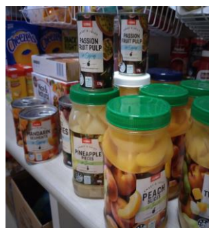
Two (2) Anonymous Food Store Donations