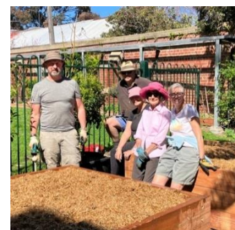
The Happy Garden Team

During Spring, many reached out offering support for SJOS. The Health Students at the University of Melbourne held their Health Expo, the StreetSmart team provided the SJOS Housing with sets of sheets and towels, some wonderful anonymous donors provided lots of food items for the Food Store, including healthy food and canned fruit, and the garden team continued to grow an array of herbs, vegetables and fruit for the Food Store. Our thanks also to the FOODILLED volunteers who have been supplying various fruit and vegetables every Saturday.