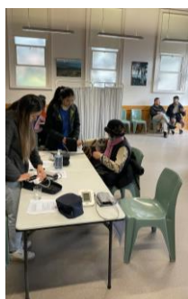
Uni of Melb Team